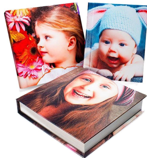
Photo Cover Option